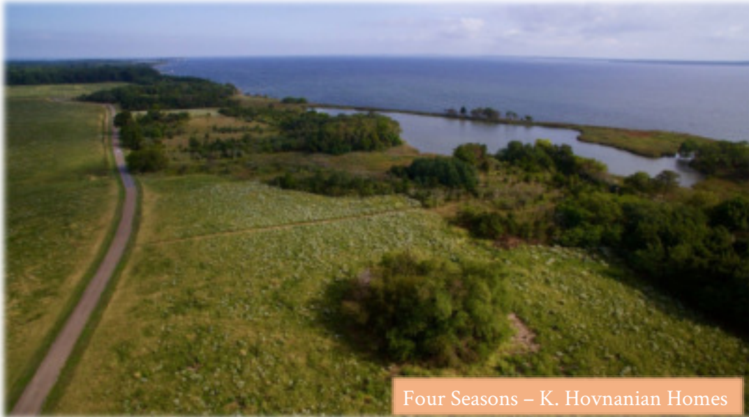
Four Seasons – K. Hovnanian Homes

Lane Engineering, LLC, is pleased to have been selected by K. Hovnanian Homes to complete the survey and design for Phases 2, 3 & 4 of Four Seasons at Kent Island. This private 55+ community of 1,079 homes will be located in Queen Anne's County. More on this project to come.