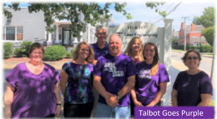
Talbot Goes Purple

Proud Sponsors of the Talbot Goes Purple Initiative that is now spreading its positive message about ways to address opioid abuse throughout the Eastern Shore.